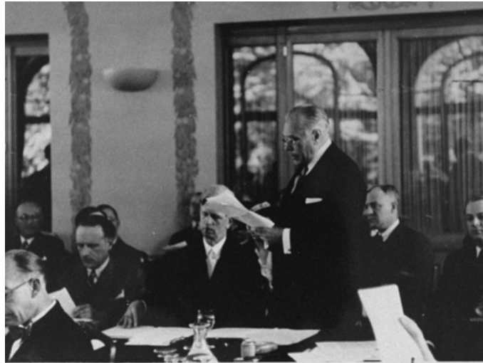
US-american representative Myron Taylor addresses the International Conference on Refugees at Evian-les-Bains, July 1938.