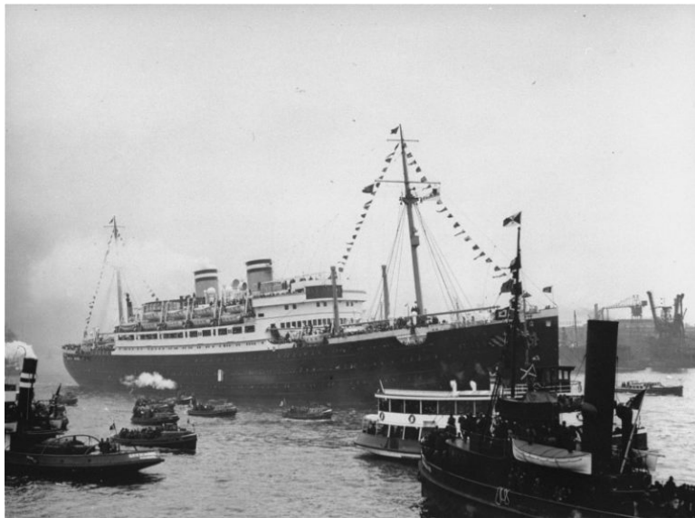
View of the St. Louis in the harbour of Hamburg, 1939.